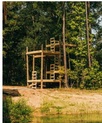
Left: A new multi-acre forested habitat includes large platforms the chimps love to climb and lounge on. Right: The Annenberg Pavilion will provide a dedicated space for visitors to learn and observe the chimpanzees.