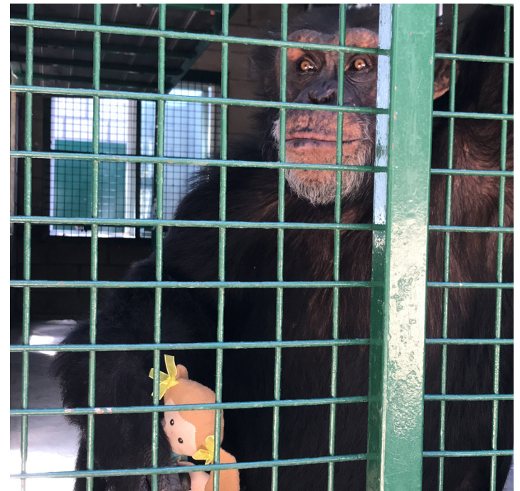
Mousse, pictured at the Waystation, is a sweet, goofy guy who loves dolls and balls.