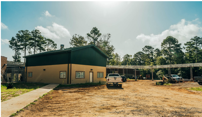
The new McGrath Lookout Lodge will house chimpanzee bedrooms, a new veterinary suite and other support facilities. Chimps will make their way across the chute to their new digs!

With what could be the final group of chimpanzees eligible for sanctuary retirement on their way to Chimp Haven, the critical final phase of expansion has arrived.