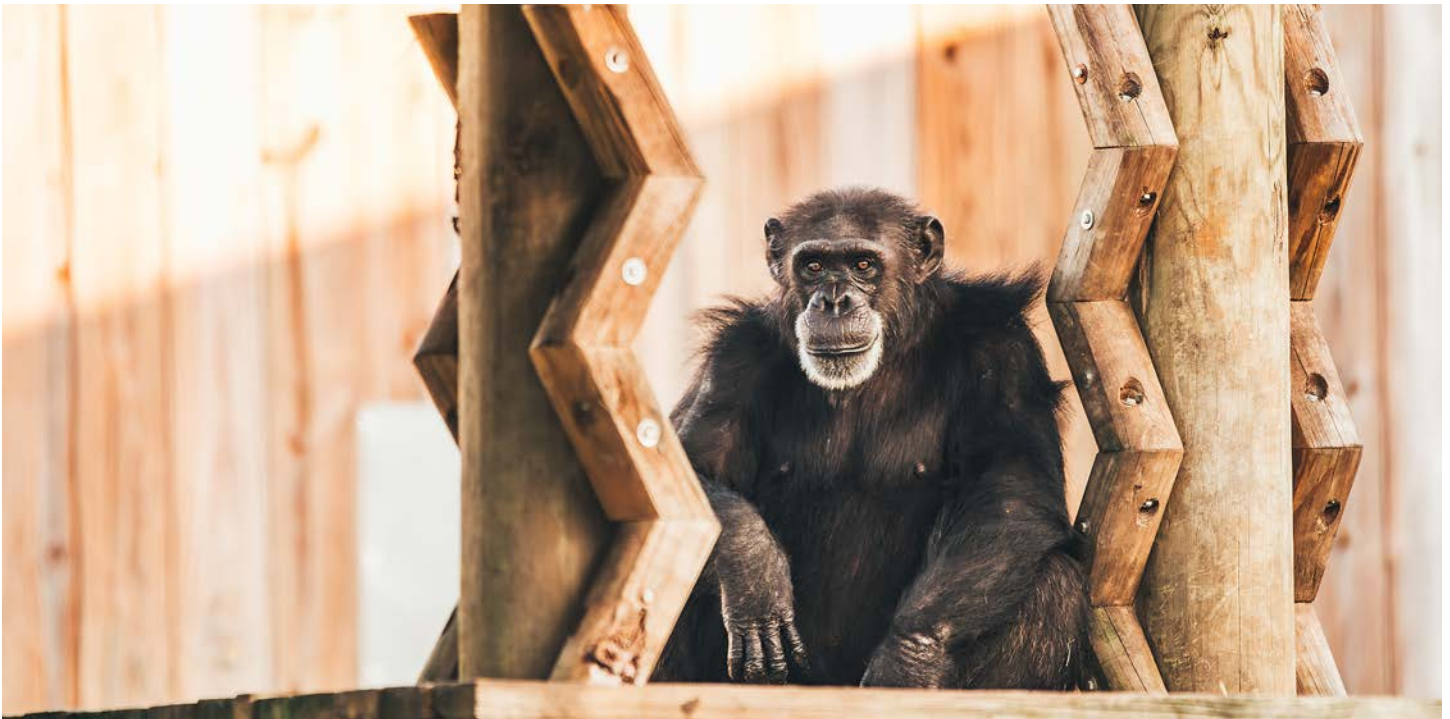
Sassy sits on her structure, which has been retrofitted with climbing aids to assist older and mobility-challenged chimps.