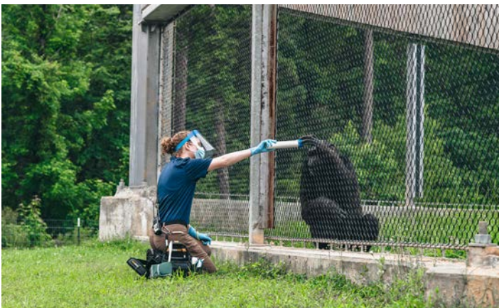
Sarah and Sonya do Positive Reinforcement Training, which encourages the chimps to participate in their own medical care.

better accommodate them as they age, creatively retrofitting furniture and structures so elderly and mobility-challenged chimps can continue to enjoy the physical and social spaces that make life at sanctuary so enriching for them.